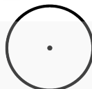
DUAL HD-SDI OR 3G-SDI STREAMING