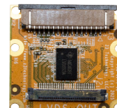
Connectors available to Z3 or MIPI compatible products